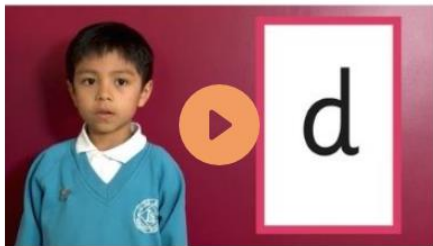
Phase 2 sounds taught in Reception Autumn 1