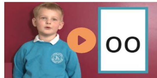
Phase 3 sounds taught in Reception Spring 1