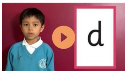
Phase 2 sounds taught in Reception Autumn 1